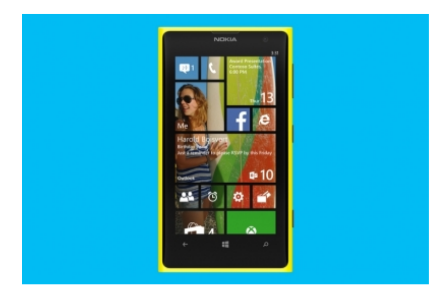
Figure 2 . Cell phone with Windows Phone 8.1 Mobile Operating System

The Windows Phone operating system has very simple graphics, but its programming language is not very well known, which prevents hackers from developing malicious software for mobile devices.