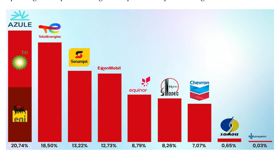
Figure 2 Operating oil companies in Angola and production quotas in August 2022